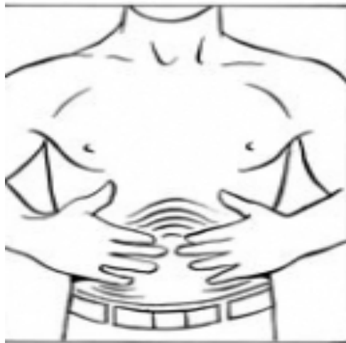
BREATHING OUT (EXHALING) WITH THE DIAPHRAGM